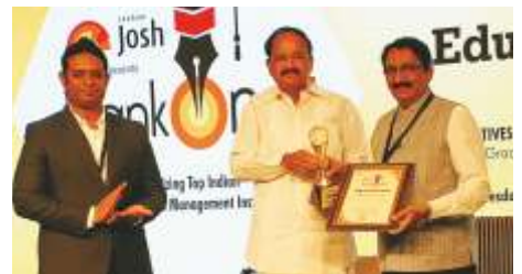
Suryadatta Institutes of Management are Ranked in "A" category & conferred with Top Institutes in Western India during 2019 at the Hands of H.E. Shri. Venkaiah Naidu, Hon'ble Vice President of India

Wellness, Health and Fitness, Performing Arts etc., Mass Communication, Animation, Film Making, Gaming and so on. Inspired by the vision of providing contemporary and quality education, backed by high quality research, and skill based training interventions as per the current needs of the industry, the group has established over 30 Institutions out of which