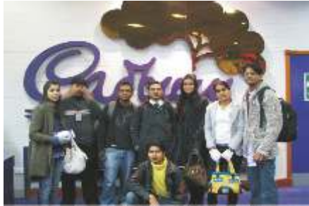
MBA Students Study tour to Cadbury UK

The learning experience at SGI is aimed at creating a world class talent pool in sync with current global needs and evolving requirements. This is ensured through initiatives such as International emersion program, global study tour, student exchange and faculty exchange programs, foreign languages training & Global projects.